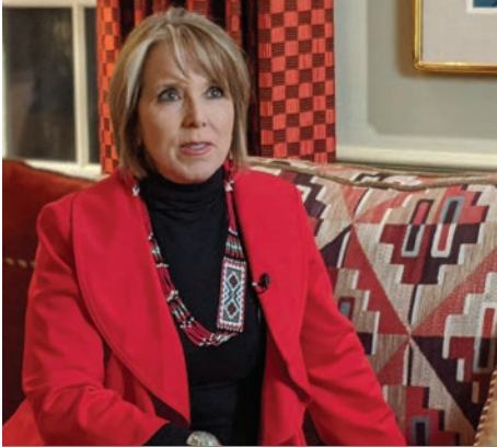
In 2020, Governor Michelle Lujan Grisham appeared on our public affairs program, New Mexico In Focus.

On August 26, NMPBS began livestreaming channel 5.1 on our website, in addition to PBS Kids on 5.2. NM viewers now have the option of watching traditional broadcast or online at the same time.