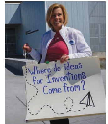
NMPBS began broadcasting APS@HOME classes for K-5 students in April 2020.