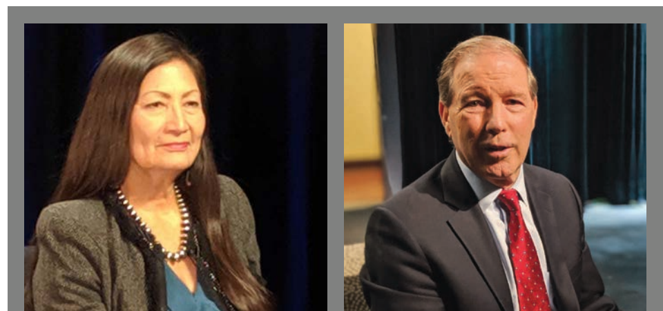
FROM LEFT TO RIGHT:

In this turbulent election year, statewide campaign coverage was also at the forefront. In October, NMiF held intimate, issues-based conversations with candidates in the First and Second Congressional District races and also conducted one of the only formal debates between the 3 contenders vying for the open U.S. Senate seat. All these broadcasts were also aired on KUNM-AM and KANW-AM radio as well as the state's other PBS stations. In addition, NMiF held a highly-viewed livestream on election night on Youtube and Facebook which included partners from local media outlets.