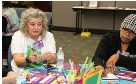
ABOVE: NMPBS’ Education Outreach staff conducted several teacher trainings on the use of PBS Kids materials & PBS Learning Media in 2020.